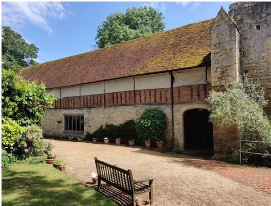
The visit to the Abbey Buildings in Abingdon Monday 12 th June 2025