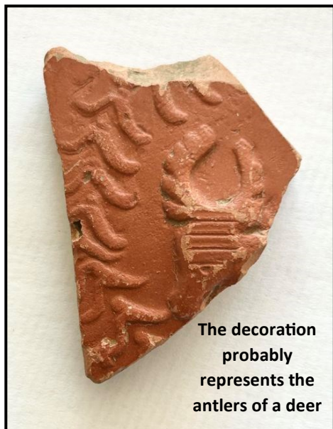
The decoration probably represents the antlers of a deer

'SAMIAN WARE' also called 'terra sigillata'. This piece of decorated Roman pottery was found locally on a country walk. This pottery was probably made in Gaul in the second century AD and exported to Britain. The stylised decoration is the result of a standard mould and was originally part of a hunting scene - the antlers of a deer are evident and the piece might have been part of an elegant bowl as in the image below.