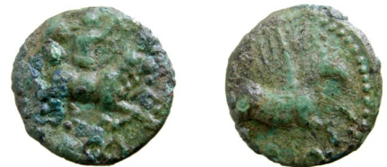
An Iron Age coin of Cunobelin* found in Abingdon