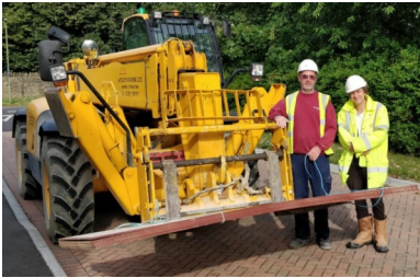
Thanks to these men and their forklift we rescued the model of the village.